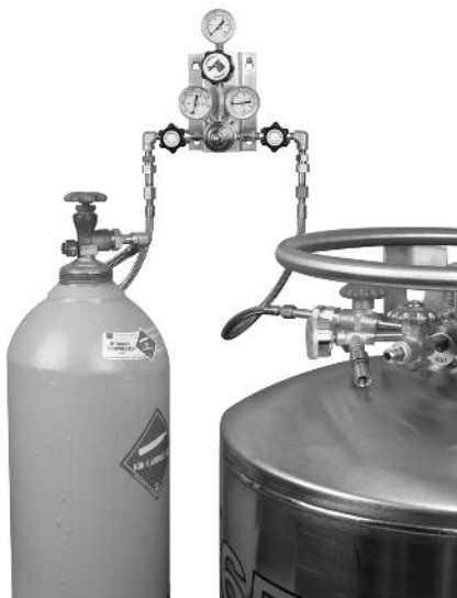
Model BRS Installed as Back-up for Cryogenic Container (Cryogenic container pigtail sold separately)

* Contact your Advanced distributor if custom factory settings are required. Advanced also offers custom systems for high flow and high pressure back-up applications. Where “(CGA)” is indicated above, insert appropriate Compressed Gas Association connection number to complete the part number. Example: BRS-B-50-590. Order by complete part number.