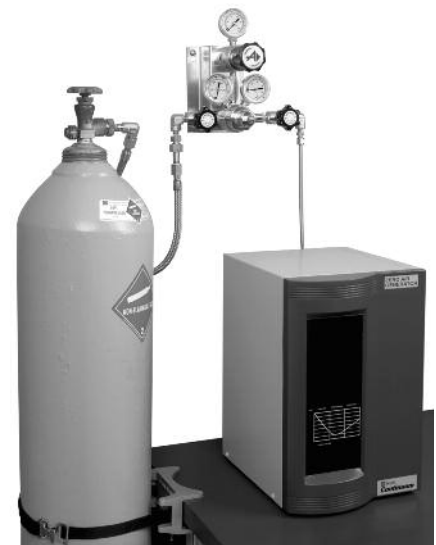
Model BRS Installed as Back-up for Gas Generator (Generator tubing sold separately)

Isolation and Vent Valves: Body: Brass Systems: Brass Bar Stock Stainless Steel Systems: Type 316 SS Bar Stock Diaphragms: Type 316 Stainless Steel Seats: PCTFE