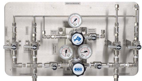
Seven Valve CRS Changeover Panel