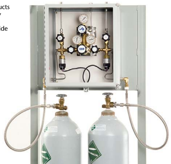
CRS Changeover Mounted in NEMA 4X Enclosure